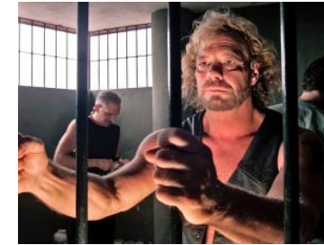
A&E cancels 'Dog the Bounty Hunter'