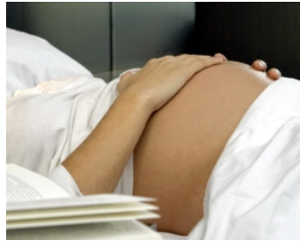
10-year-old gives birth to baby boy